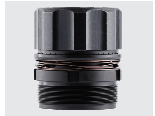
DEAD AIR KEYMO