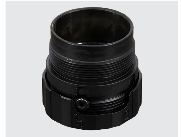
SILENCERCO ASR BRAVO