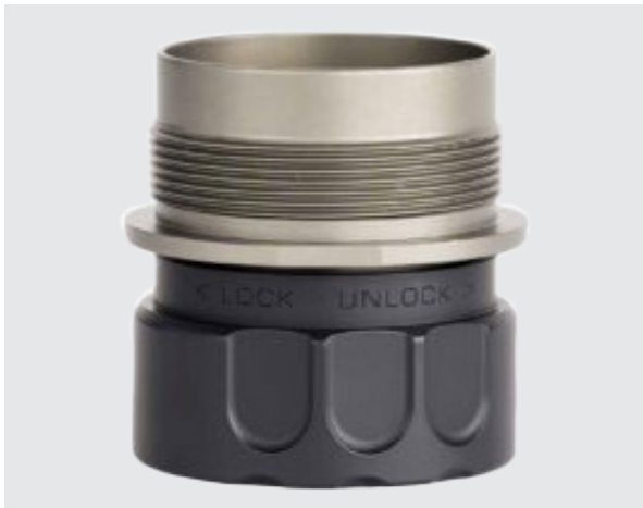
RUGGED UNIVERSAL MOUNT (RUM)