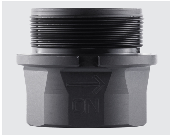
DEAD AIR XENO