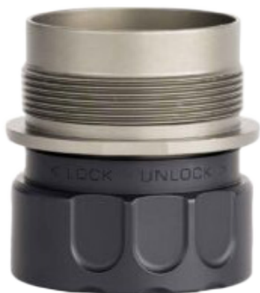
RUGGED UNIVERSAL MOUNT (RUM)