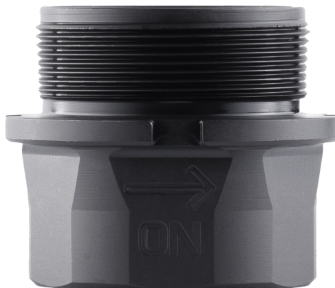
DEAD AIR XENO