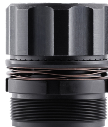
DEAD AIR KEYMO