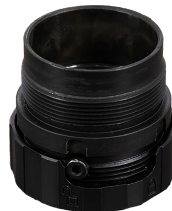
SILENCERCO ASR BRAVO